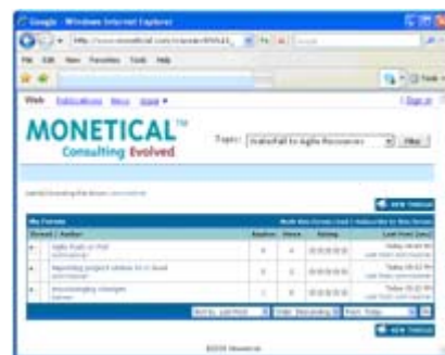
Figure 3 – Online Agile discussion forums

Access a series of discussion groups with other professionals to share best practices and experience on the key factors influencing software and I.T. projects that have adopted Agile methodology.