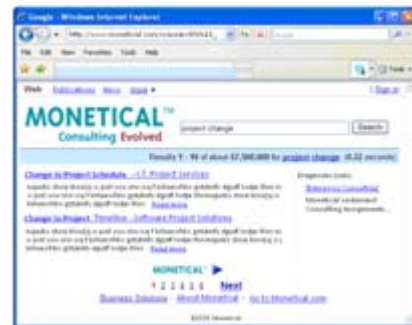
Figure 2 – Online Agile expertise repository

An extensively populated database, containing subject matter material covering all aspects of enterprise and operational change programme activities, provide real-time rapid and accurate access to qualified knowledge. This expertise is exploited to help the planning, execution or optimisation stages of the business change programme.